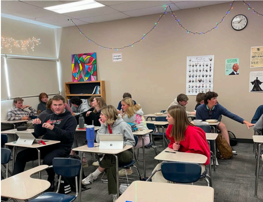
RJHS FBLA WROTE CARDS FOR SENIORS AND COLLECTED CANNED FOOD FOR THE HOLIDAYS

Members have been busy preparing for the district conferences coming in January!