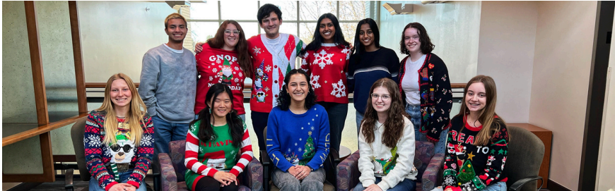
YOUR STATE OFFICER TEAM WAS HARD AT WORK MEETING IN DENVER