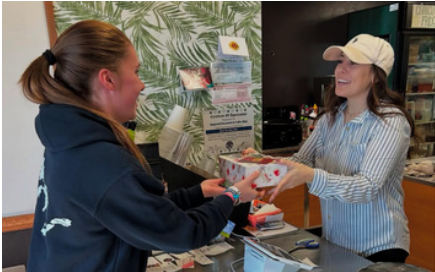
FLAGLER FBLA GAVE COOKIES TO LOCAL BUSINESS OWNERS