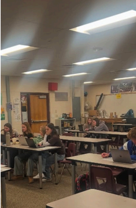
CHATFIELD FBLA IS IN PREP MODE!