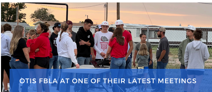
OTIS FBLA AT ONE OF THEIR LATEST MEETINGS