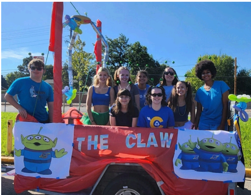
ARAPAHOE HIGH SCHOOL IN THEIR PARADE!

Members are getting involved with national and state level programs!